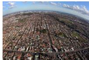
Conurbation -extended urban area