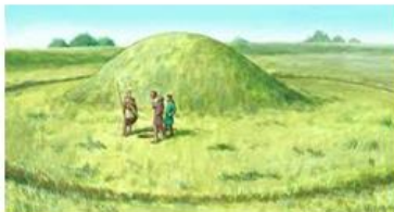
Tumulus - a barrow, ancient burial mound