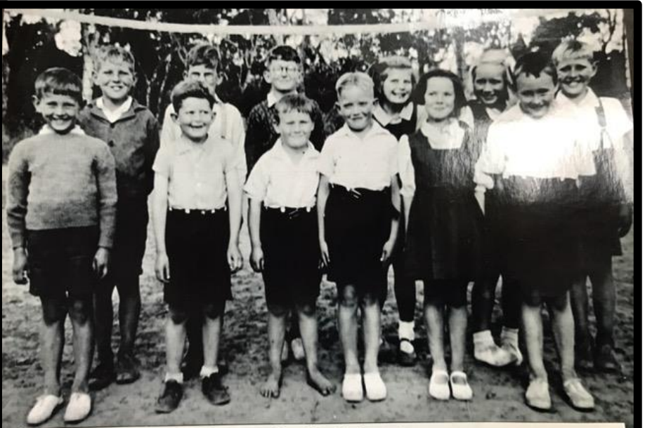
Peats Ridge Public School – 1940