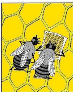
So, Where are we exactly?

While our swimmers were competing at the pool, the rest of us had a lot of fun creating some wonderful tessellations in Maths. We looked at lots of 2D shapes then concentrated on only those that tessellate (fit together with no gaps, like tiles). We studied amazing patterns in nature and even made our own hexagon-shaped honeycomb cells out of toilet rolls!